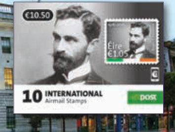
PRODUCT CODE 16DBK2 PRICE €10.50

The stamps feature Augmented Reality, and when scanned by a smartphone with the CEE App installed, will give access to background information on the Rising, and also link customers to gpowitnessthistory.ie . In March, an exciting range of souvenir product will be introduced.