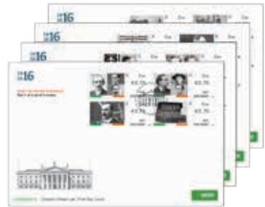
PRODUCT CODE 16DL1FDC, 16DL2FDC, 16DL3FDC, 16DL4FDC PRICE €3.80 each