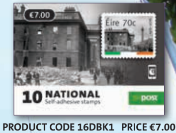
PRODUCT CODE 16DBK1 PRICE €7.00