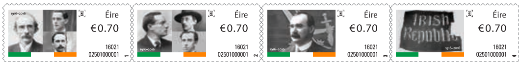
Leaders and Icons Code 16DL1 Price €2.80