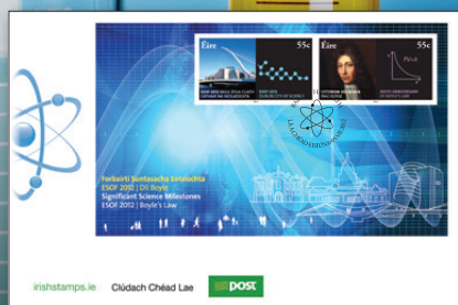
PRODUCT CODE 1212FDCMS PRICE €2.10