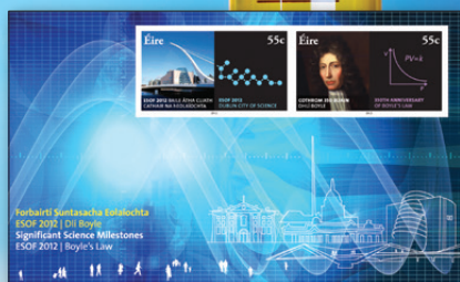
PRODUCT CODE 1212MS PRICE €1.10