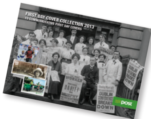
Irish Stamp Year Pack 2013 Product Code 13YP Price €32.00