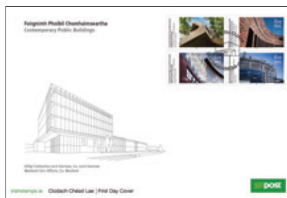
PRODUCT CODE 1316FDC PRICE €4.00