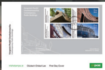
PRODUCT CODE 1316FDCMS PRICE €4.00