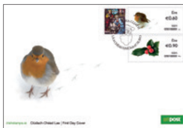
PRODUCT CODE 1317FDC PRICE €3.10

Some of the carol's other religious references are equally fascinating. The "six geese a-laying" actually means the six days it took to create the world. While the "ten lords a-leaping" represent the Ten Commandments. And what about the "twelve drummers drumming"? Well, they refer to the twelve doctrines of the Apostle's Creed.