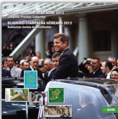
Irish Stamp Year Book 2013 Product Code 13YB Price €65.00