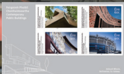
PRODUCT CODE 1316MS PRICE €3.00