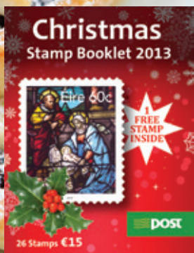
PRODUCT CODE 1317BK PRICE €15.00