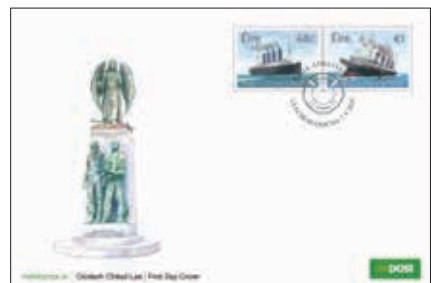
PRODUCT CODE 1507FDC PRICE €2.68

explosion rocked the ship and the Lusitania sank within 18 minutes.