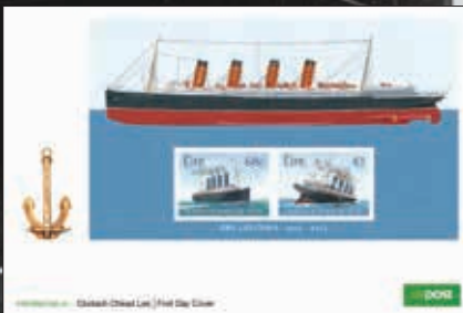
PRODUCT CODE 1507FDCMS PRICE €2.68