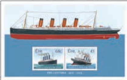
PRODUCT CODE 1507MS PRICE €1.68